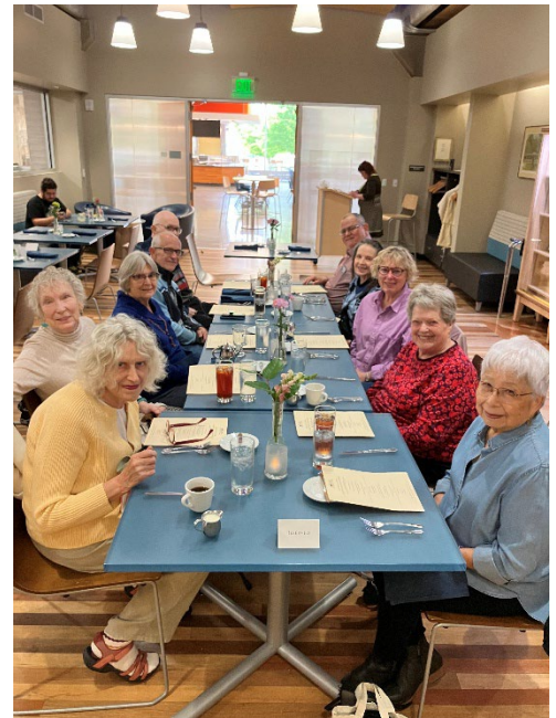
Group

Another luncheon is tentatively planned before the end of May- check the bulletin boards for announcements!